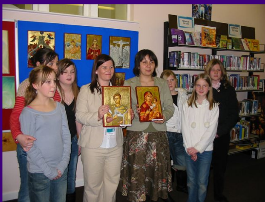
Members of the reading group with some of the Art works